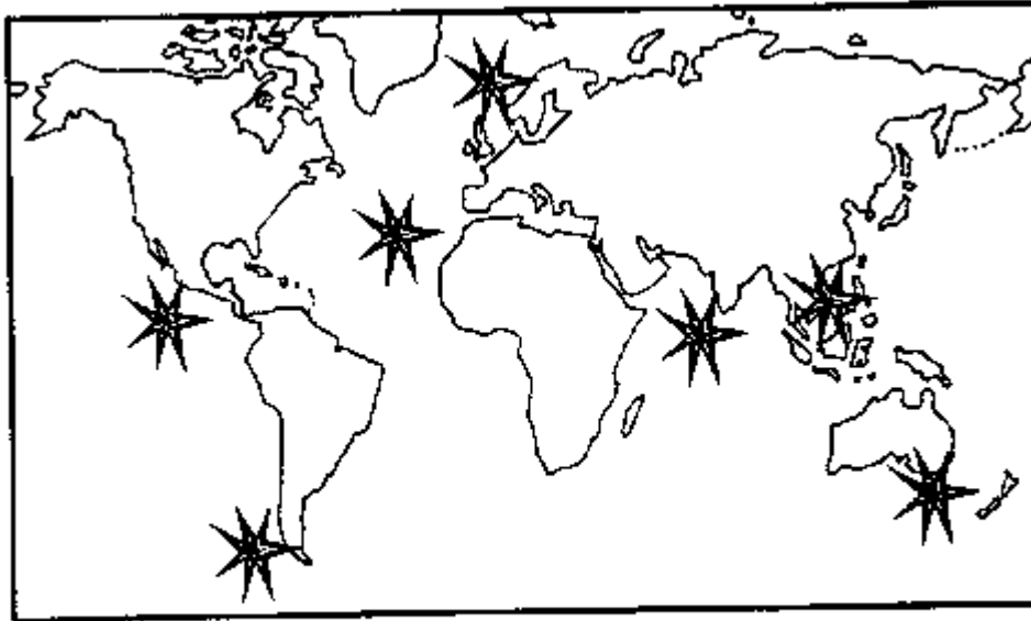
The seven impact sites of the 7640 BC comet, after Tollmann.

You see, the flood was an interplanetary not a planetary event. It took place, give or take a few years in 7640 BC when a comet broke up and crashed down into the oceans, perhaps more or less as indicated by the map. The result were tidal waves that ran across land masses to a calculated height of 5 kms. Then followed rain, lots of it as the splashed up water created a Green House atmosphere around the planet.